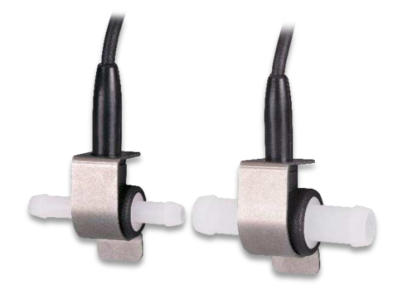
Clip Mounting models

The clip mounting is a lightweight sensor, which allows a flexible way of connecting the electronics. The clip mounting covers flow rates from 20 millilitres up to 40 litres per minute and is also available for PVDF and PFA flow tubes.