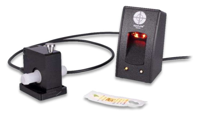
The Tubeholder System connected to the Barcode Scanner

Without calibration, the exchange of turbine tubes would lead to undesirable measurement deviations. Suppose that you use a tube with a K factor of 1,998 instead of one of 2,000 on which the system is set. With every 1,000 liters, more than 1 liter difference in the amount of liquid occurs. In a medicine formula, that can mean the difference between a good batch and a batch that is rejected.