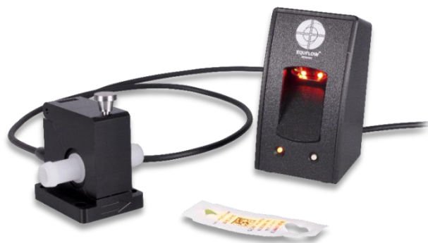
The Tubeholder System connected to the Barcode Scanner

Without calibration, the exchange of turbine tubes would lead to undesirable measurement deviations. Suppose that you use a tube with a K factor of 1,998 instead of one of 2,000 on which the system is set. With every 1,000 liters, more than 1 liter difference in the amount of liquid occurs. In a medicine formula, that can mean the difference between a good batch and a batch that is rejected.