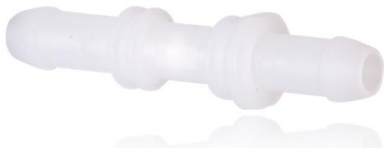
Disposable PVDF turbine flow tube

Equflow produces three versions of this type of tube.