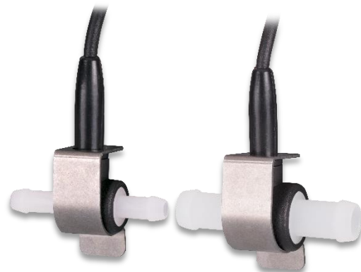
Clip Mounting models

The clip mounting is a lightweight sensor, which allows a flexible way of connecting the electronics. The clip mounting covers flow rates from 20 millilitres up to 40 litres per minute and is also available for PVDF and PFA flow tubes.