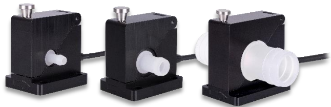
Tubeholder System models

to your system. The Tubeholder system is available for PVDF and PFA flow tubes and cover flow rates from 20 millilitres up to 120 litres per minute.