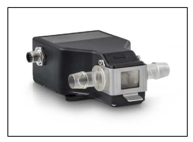
Fig 1. FLEXMAG 4050 C

Electromagnetic flowmeters subject conductive liquids to alternating or pulsating DC magnetic fields. Electrodes on either side of the pipe wall pick up the induced voltage following Faraday's Law, which is proportional to fluid velocity. Measurement is independent of density, temperature, viscosity and pressure and is extremely accurate, with a wide flow measurement range. They also have no moving parts or obstructions in the flow path. However, the measured liquid must be conductive for proper operation. The new technology, the FLEXMAG 4050 C, is composed of a compact transmitter and a biocompatible single-use disposable flow tube with single barb fitting that can be removed after use. It is designed to be part of single use OEM machines. The transmitter is installed in the machine and connected to the control system while the FLEXMAG flow tube gets assembled and integrated into a single use process flow kit. Figure 1 shows the flowmeter.